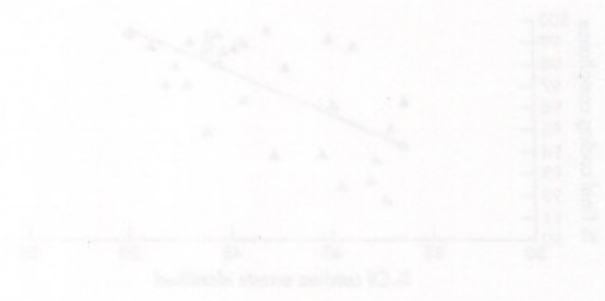
Figure 2. Correlation between number of calls and survival rate.